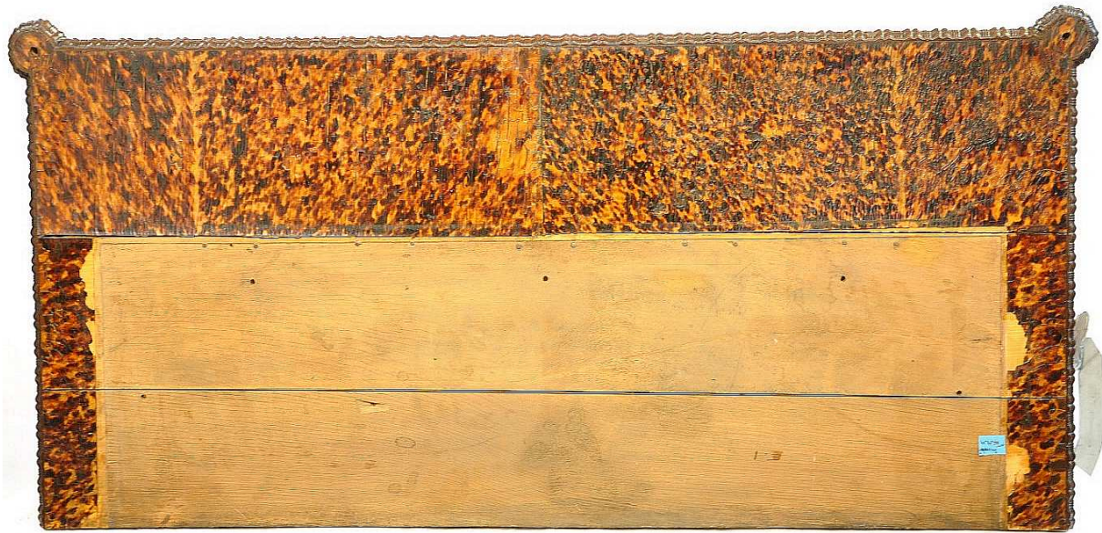
Figure 7 The top is saturated.