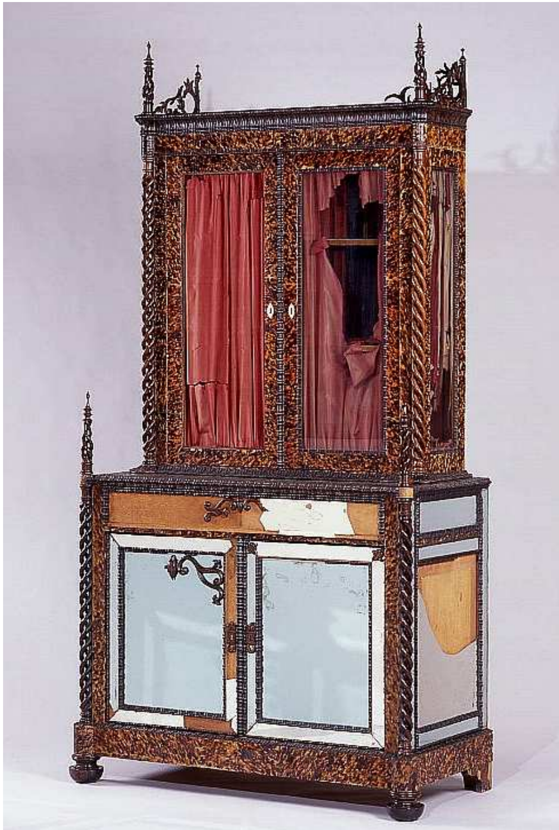
Figure 1 The silverware cabinet.

And it was in this period that Koster acquired the title ‘Royal Purveyor of tortoiseshell furniture’.