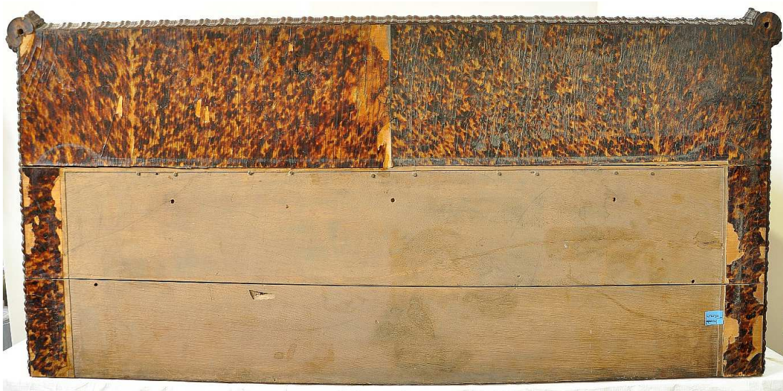
Figure 5 The left part of the top is consolidated.

The distorted parts of the imitation tortoiseshell were plasticized with a mixture of water and ethanol and consolidated with a mixture of fish and hide glue. Then the surface was clamped with acrylic sheets. The clamps were temporarily removed in order to wipe off the excess glue with a slightly dampened microfibre cloth. The surface was then clamped for 24 hours and cleaned again (cf. figure 4).