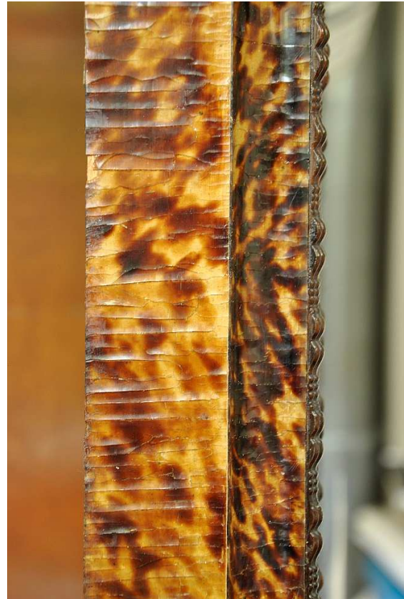
Figure 2 The pattern of craquelure.

The most common pattern of craquelure starts at the edges. The finest cracks are visible to the eye only as dullness, but as the material deteriorates further, repeatedly going through cycles of shrinkage and expansion, small cracks appear. These are visible along all the edges and can, at their worst, run through the whole surface to the opposite edge. This process is accelerated by moisture acting on the increased surface area of the distorted areas. Especially when brittle, these areas can easily chip off, making the substrate visible. In areas where the substrate cannot expand and contract because of underlying joints, there is hardly any damage visible.