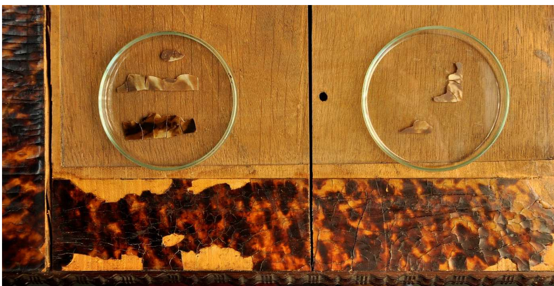
Figure 6 Detail of top with reconstructions.