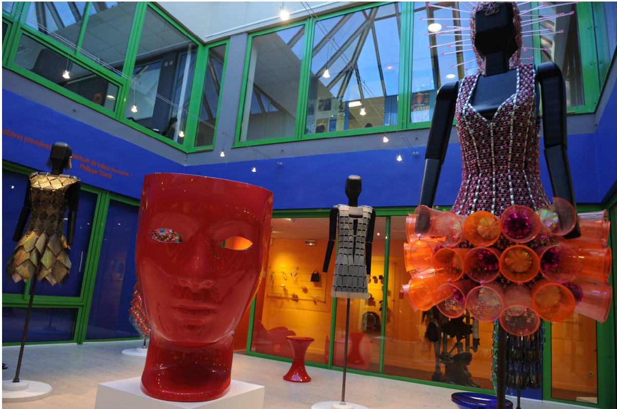
Figure 3 Poster of the 'Museum of the Comb and Plastics Industry', Oyonnax.